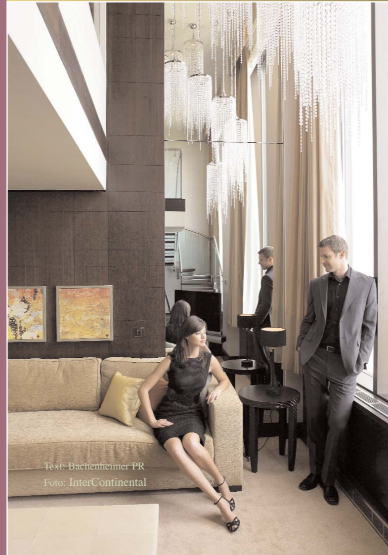
Text: Bachenheimer PR

To celebrate InterContinental's sponsorship of the Aston Martin Racing Team, the brand's flagship property - the InterContinental London Park Lane - is delighted to announce exclusively reader's package for Trésor: